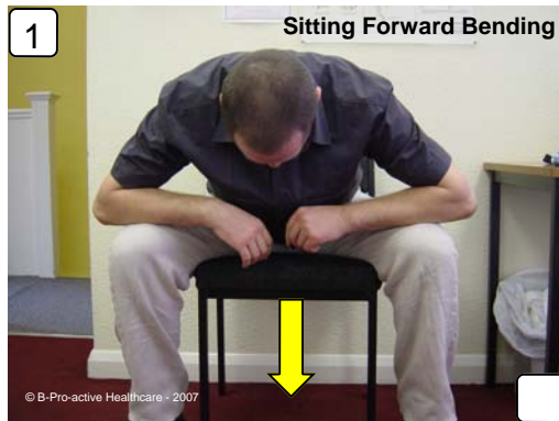
1 Sitting Forward Bending Sit back in your chair. Separate your legs. Bend forward resting your elbows on your knees. You can touch your toes if you can.