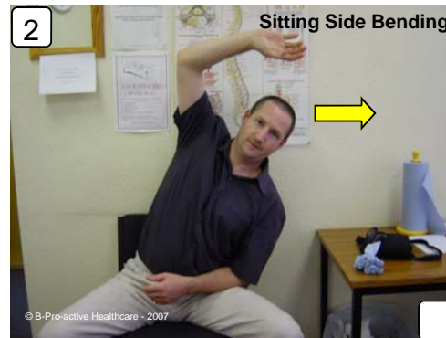
2 Sitting Side Bending Sitting upright, rest your elbow on your thigh as shown and lean on it as you side bend. Use your opposite arm as a lever to get a greater stretch. Repeat for opposite side.