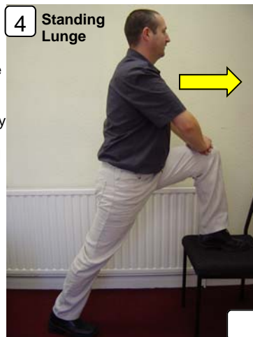
4 Standing Lunge Standing half a meter from the chair, place foot in the middle of the seat pan. Place hands on the knee for support. Gently lean forward. Keep your body upright, looking straight ahead and hold for the allotted time. Feel a gentle stretch with no pain.